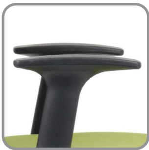
Fix Armrest (Optional)